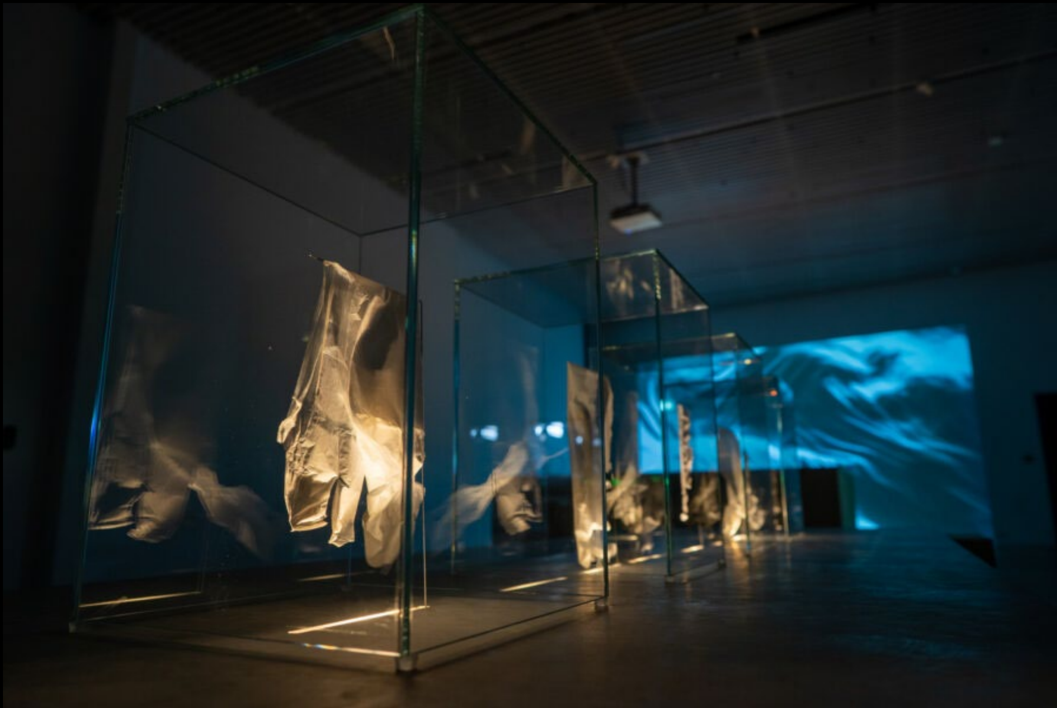
The abstract animated film was an audio-visual component of the exhibition, a looping sound- and filmtrack.