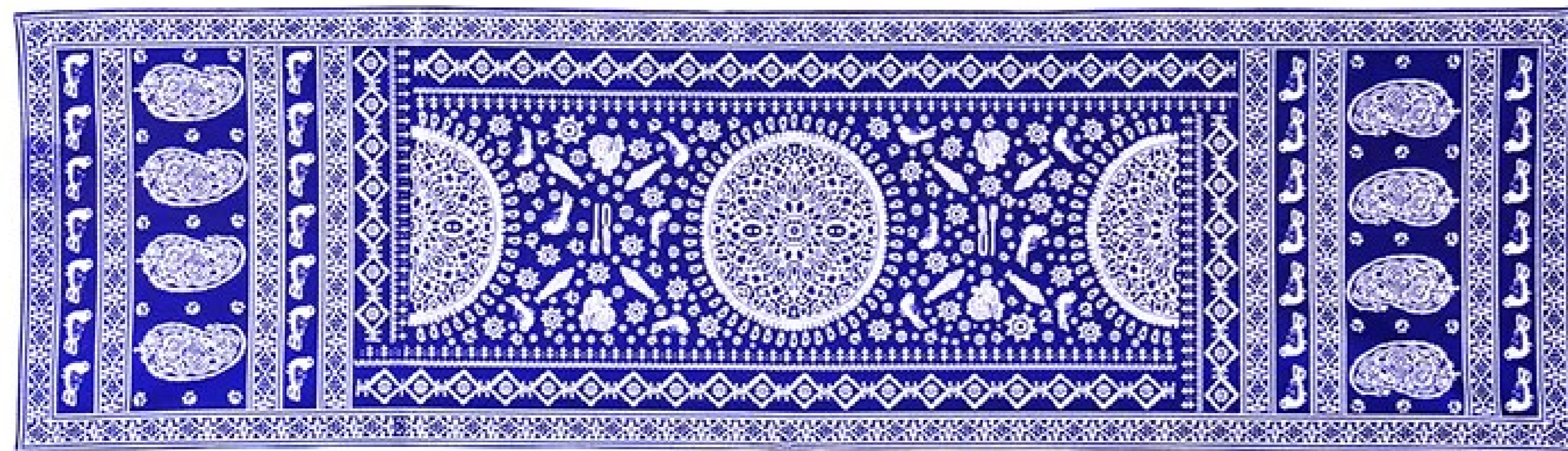
Background / Inspiration.