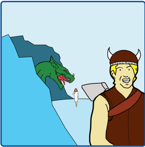
01 Sacrificing a virgin to a dragon