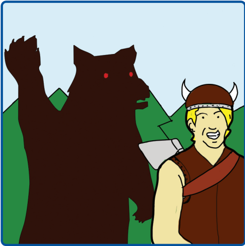
04 Local entertainment