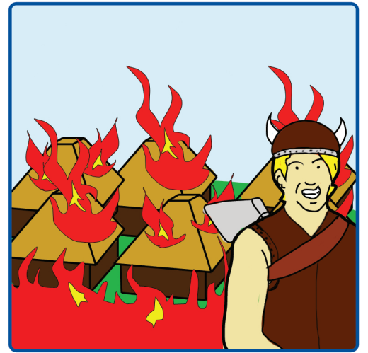
03 Doing some sightseeing