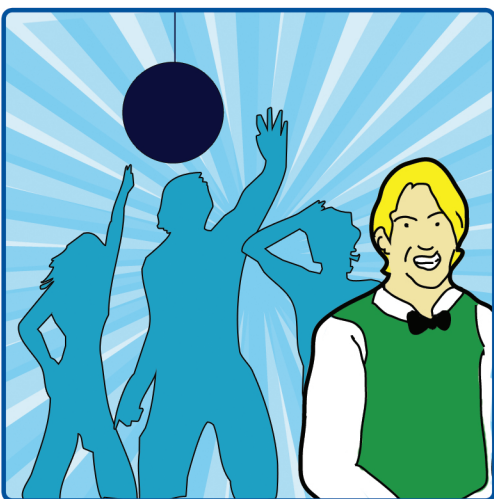
04 Local entertainment