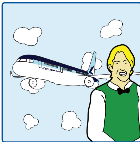
02 Flying with Estonian Air