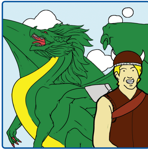
02 Riding the dragon