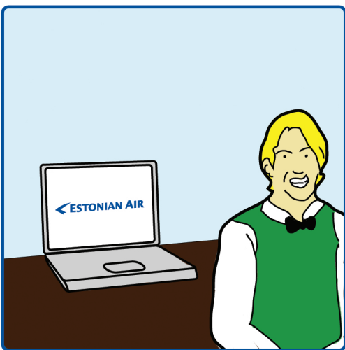
01 Buying a ticket